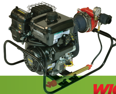
OPTIONAL TWO STAGE PUMP END